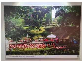
Ukrainian winner, Sofia Serdiuchenko "First breathing of autumn" shows calm pace of life, spring turns into summer, summer slowly turns into autumn, all is cyclically like events in our life. The photo exhibits a small part of Europe like a pleasant atmosphere in hearts of everyone who observes daily modern changes and stops for a second and to breath in such a