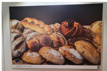
Winner of Hungary, Akos Kripkó "Breads" ("Bread") - The first thing I thought about when I heard INSPIRED BY EUROPE is like the motto of the European Union, which is united in diversity. And somehow I connected to that, that bread is very diverse. It comes in different types, of alerts. And basically, it's a metaphor for Europe. That's it. Diversity. The photo was taken in my room. It was set up with ring lights and basically, I went to the farmer's supermarket and bought different kinds of bread and photographed them.