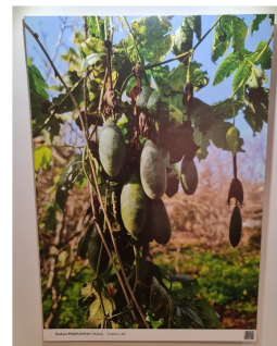
Winner of Malta, Rodion Podruchnyi "Green Life" - My picture was called "Green Life". With this I wanted to show that living in Europe has several green meanings. The territory of Europe itself is very green - there is beautiful nature and fertile land. Europe is very concerned about ecological issues, preservation of a green planet (Green course).